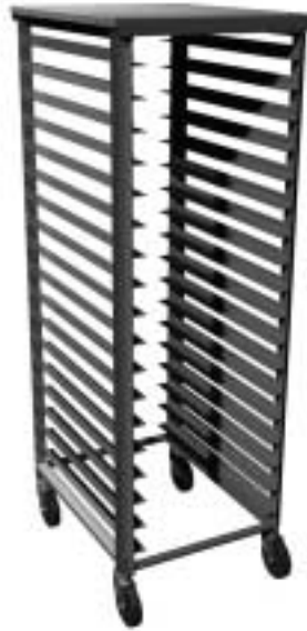
RA183N-TN Full-Height Rack with Top