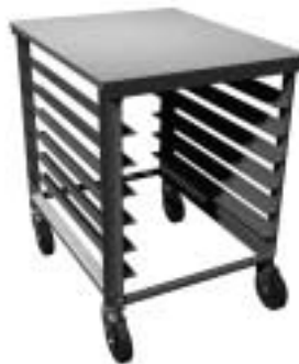
RA63N-TN Half-Height Rack with Top