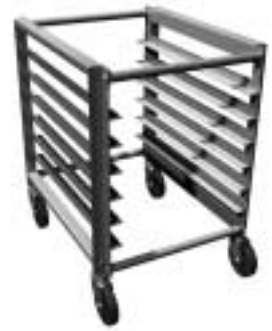
RA63N Half-Height Rack without Top