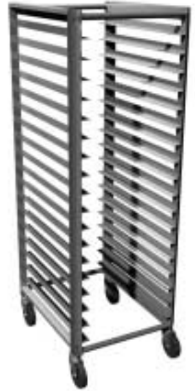
RA183N Full-Height Rack without Top