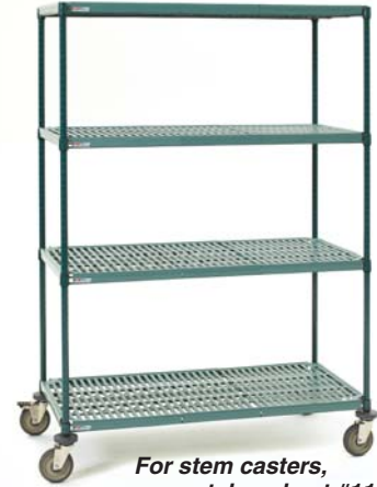
For stem casters, see catalog sheet #11.20

NOTE: Not suitable for cart wash applications.