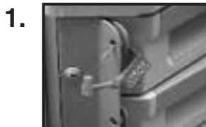
Insert security seal.