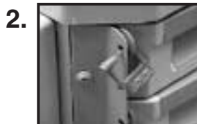
Close security seal.