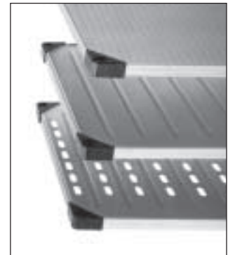
Flat, Embossed, Louvered/Embossed

SiteSelect™ Posts are grooved at 1" (25mm) increments and numbered at 2" (50mm) increments. Posts are double-grooved every 8" (203mm) for easy identification.