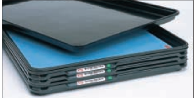
SmartTray™ features barcoding and color coding, and stacks with other trays of the same footprint.

Put the SmartTray advantage to work for you!