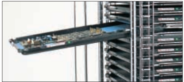
SmartTray™ engages with wire cart design to provide optimum ergonomic access.