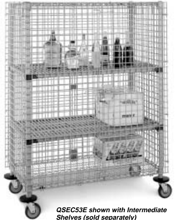
QSEC53E shown with Intermediate Shelves (sold separately)