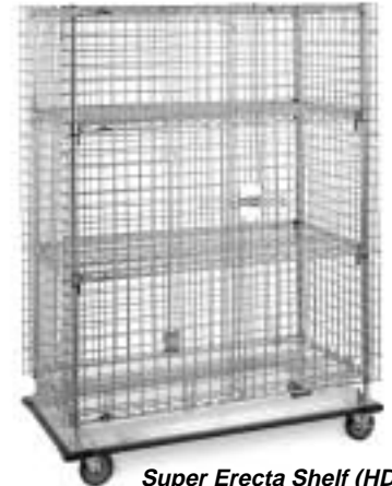
Super Erecta Shelf (HD Mobile) with optional Super Adjustable/ Super Erecta® Intermediate shelves