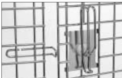
handle (open position)