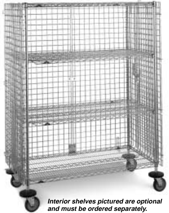
Interior shelves pictured are optional and must be ordered separately.