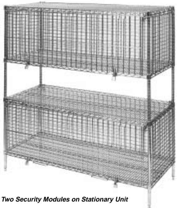
Two Security Modules on Stationary Unit