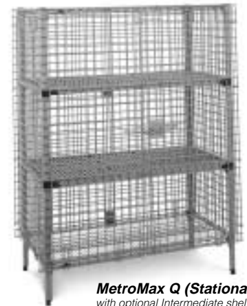
MetroMax Q (Stationary) with optional Intermediate shelves