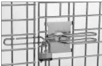
handle (closed position)