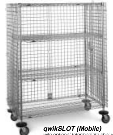
qwikSLOT (Mobile) with optional Intermediate shelves