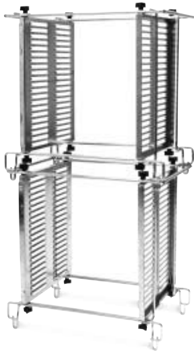
Two CBC11C's Stacked