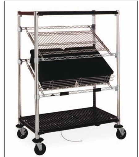
MQ2442AS (shown above as part of a complete cart)

*Note: As part of the improved MetroMax iQ Storage System, minor dimensional changes were made to the MetroMax Q ESD shelves, stencil storage levels and backstops, reel storage levels, adjustable slanted shelves, and utility cart handles. Unless otherwise noted, these items are not compatible on MetroMax Q ESD units manufactured prior to May, 2009.