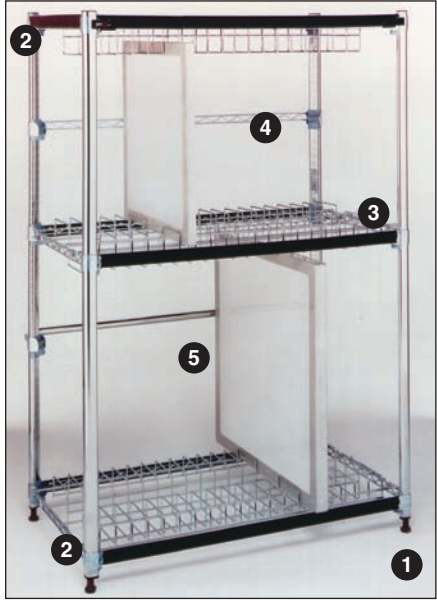
MQN546CSTL (shown with optional accessories)

*Note: As part of the improved MetroMax iQ Storage System, minor dimensional changes were made to the MetroMax Q ESD shelves, stencil storage levels and backstops, reel storage levels, adjustable slanted shelves, and utility cart handles. Unless otherwise noted, these items are not compatible on MetroMax Q ESD units manufactured prior to May, 2009.