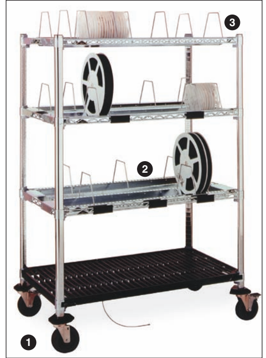
MQN545CRS (shown with optional accessories)

*Note: As part of the improved MetroMax iQ Storage System, minor dimensional changes were made to the MetroMax Q ESD shelves, stencil storage levels and backstops, reel storage levels, adjustable slanted shelves, and utility cart handles. Unless otherwise noted, these items are not compatible on MetroMax Q ESD units manufactured prior to May, 2009.