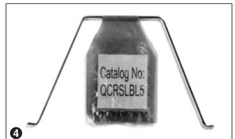
QCRSLBL5 (shown with divider)