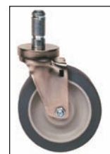
Q5MFA Vibration Suppression Caster