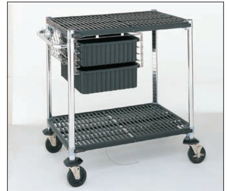
QESD Utility Cart (shown with optional accessories)

*Each utility cart includes 2 shelves, 4 posts (33"), one grounding cable, one handle, two swivel casters (5MDXAs) and two brake casters (5MDBXAs).