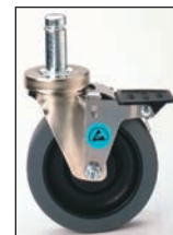
Q5MBESD Non-Marking Conductive Brake Caster