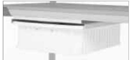
Shown with Tote Box, sold separately