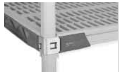
"S" Hook and Intermediate "S" Hook Kit