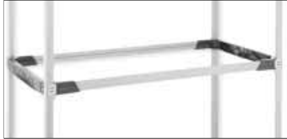
18"x48" (457x1219mm) Storage Level Frame