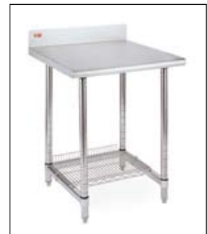
LTS30US with accessory wire shelf

Stainless Lab Tables are load rated at 50 lbs. per sq. foot (.024kg per sq. cm) up to a maximum of 600 lbs. (273kg) assuming evenly distributed load and caster specification meets requirement.