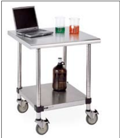
LTSM30IS with casters