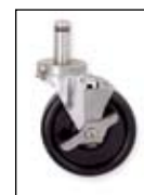
5MHTN & 5MHTNB