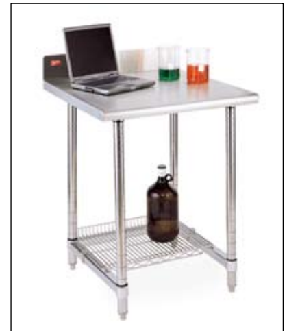
LT30US with accessory stainless wire shelf

Epoxy resin: Epoxy resins, silica, organic fillers, and inert hardeners are cast in forms and cured to a uniform mixture throughout.