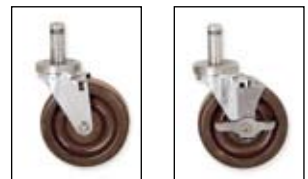
5MHTP and 5MHTPB (Hi-temp phenolic autoclave casters)