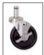
5MHTP & 5MHTPB