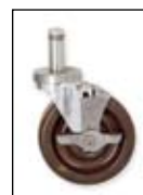
5MHTP & 5MHTPB