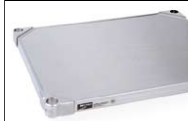
All stainless solid shelf with stainless corners