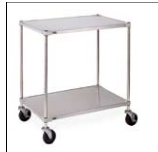
LC2S1824 (casters ordered separately)

Note: To build a lab cart according to specific requirements, follow instructions (D) on page 7. Refer to Autoclave guidelines, below, for important checklist to follow.