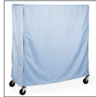
LC5S2460 with autoclave cart cover (casters ordered separately)

Note: Autoclave cart covers are rated for approximately 70 cycles per cover.