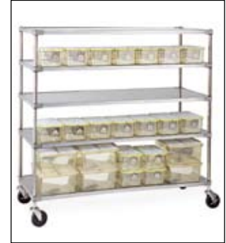
LC5S2460 (casters ordered separately)

Note: To build a cage rack according to specific requirements, follow instructions (D) on page 7. Refer to Autoclave guidelines, below, for important checklist to follow