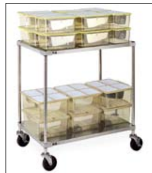
LC2S2436 with autoclave casters