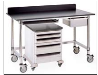
LTSM60UPB with accessories, casters, backsplash accessory, and Starsys™ cart

Stainless Lab Tables are load rated at 50 lbs. per sq. foot (.024kg per sq. cm) up to a maximum of 600 lbs. (273kg) assuming evenly distributed load and caster specification meets requirement.