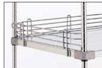
4" (101mm) Ledges

*Actual ledge length is approximately 1" (25mm) shorter than nominal shelf length/width.