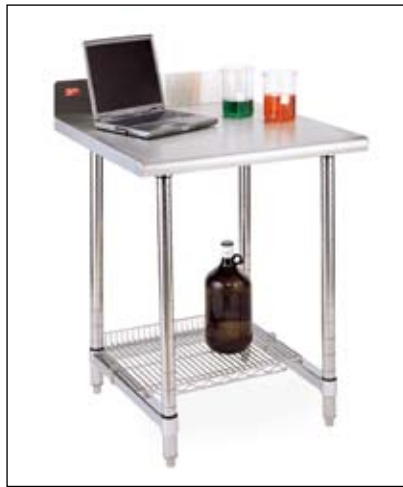
LT30US with accessory stainless wire shelf

Epoxy resin: Epoxy resins, silica, organic fillers, and inert hardeners are cast in forms and cured to a uniform mixture throughout.