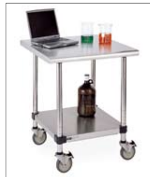
LTSM30IS with casters