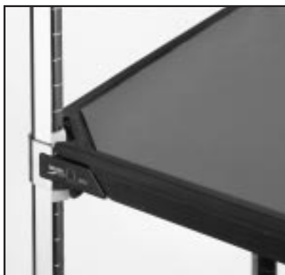
MetroMax Q ESD Inlay