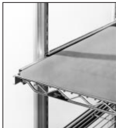
ESD Open Starsys Inlay

ESD Shelf Inlays: ESD Shelf Inlays are the perfect complement to Metro's open wire shelving products in any electronics production environment. Convert your Metro shelf or wire cart into a "soft" solid surface for added protection of your most sensitive and abrasion-prone housings and subassemblies. Consider some of the following benefits: