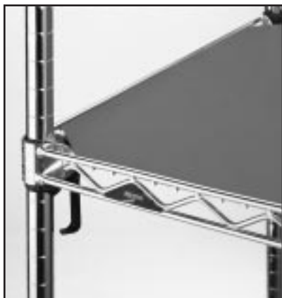
Super Adjustable ESD Inlay