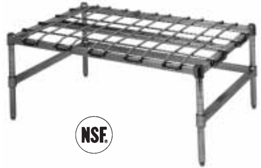
Stationary Dunnage Racks With Mat