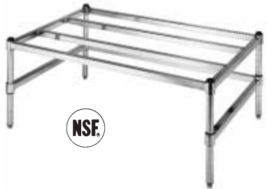
Stationary Dunnage Racks Without Mat