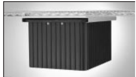
One-Piece Slide (tote sold separately)