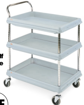
3-Shelf Deep Ledge