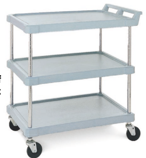
3-Shelf BC Series Flat

Specifications: Utility cart consisting of at least 2 polyethylene, injection-molded shelves containing Microban® antimicrobial product protection, chrome-plated posts or handle. 2-shelf cart may accept an intermediate shelf if necessary. Cart has four 4" (102mm) diameter, resilient rubber swivel stem casters. Cart rated at 150 lbs. (65kg) capacity per shelf, 400 lbs. (180kg) per unit.