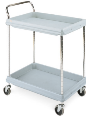
2-Shelf Deep Ledge