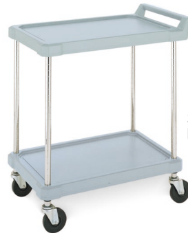
2-Shelf BC Series Flat