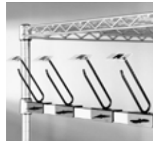
Close-up of Catheter Side Bar