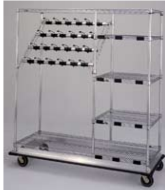
Model # CPC2/3LC – Standard Combination Style with 24" (610mm) bars and 36" (910mm) shelves