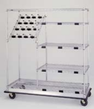
Model # CPC3/2LC – Standard Combination Style with 36" (910mm) bars and 24" (610mm) shelves