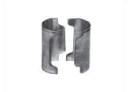
Aluminum Split Sleeves

Aluminum Split Sleeves with Stainless Steel Retainer Rings. Cat. No. 9986S