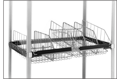
Baskets fit on frames level or at a 10° angle