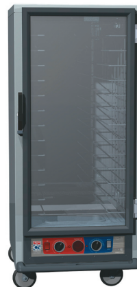
3 / 4 Height