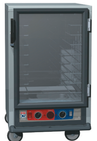
1 / 2 Height