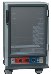
1 / 2 Height