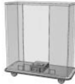
Standard Electric Thermal System