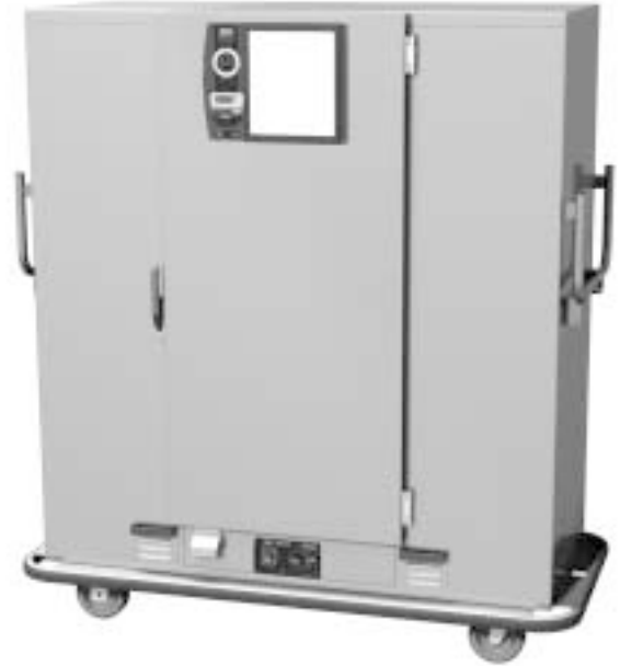
MBQ-180-QH — 180 Plate Capacity with Quad-Heat™ Dual Fuel