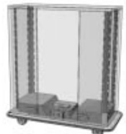
Quad-Heat™ Dual Fuel Thermal System