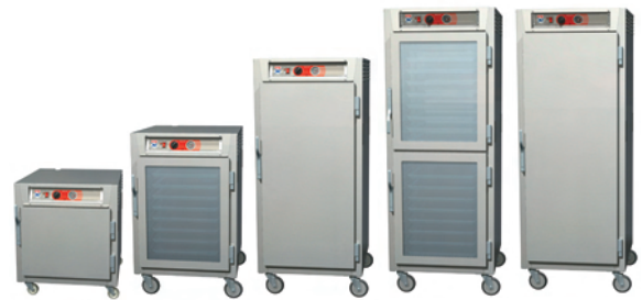
Under Counter Full Solid Door 1/2 Height Full Clear Door 3/4 Height Full Solid Door Full Height Dutch Clear Doors Full Height Full Solid Door