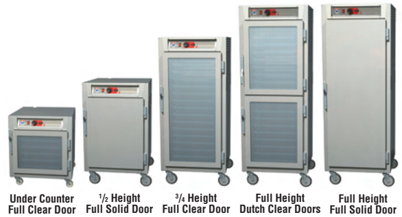
Under Counter Full Clear Door 1/2 Height Full Solid Door 3/4 Height Full Clear Door Full Height Dutch Clear Doors Full Height Full Solid Door