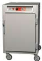
1/2 Height Solid Doors