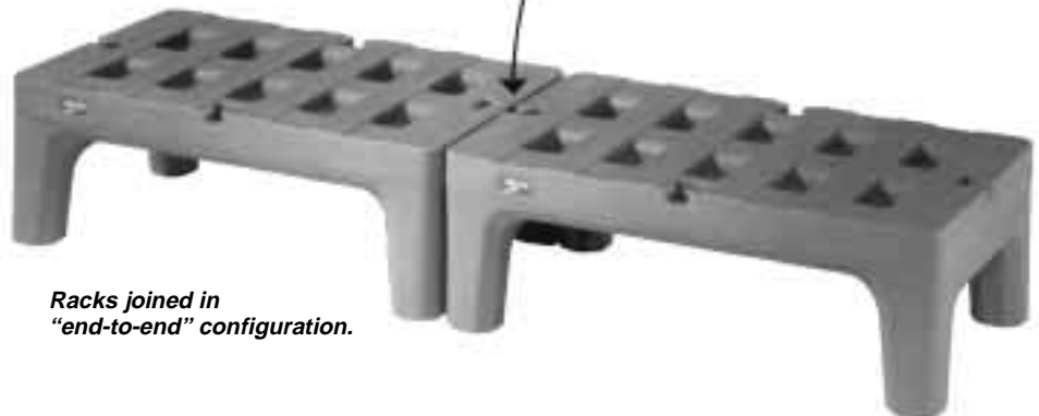
Racks joined in “end-to-end” configuration.