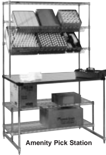
Amenity Pick Station

Equip and organize the housekeeping cart prep area with Storage/Pick stations and high-density Tote Storage Cart.